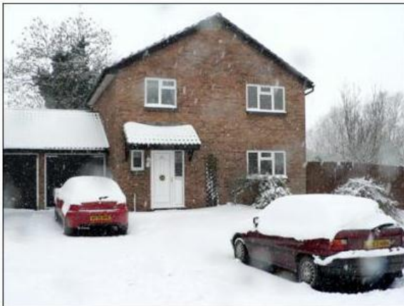
Is your property ready for winter?