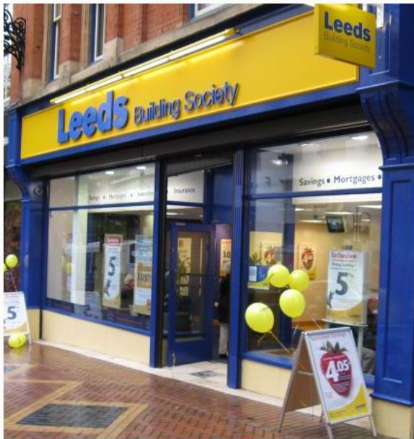
Yorkshire lenders are doing their bit

Leeds Building Society is offering a 3-year fixed rate mortgage range. The Society has just reduced rates by 0.31% and therefore those with a 25% deposit or more can take advantage of the new 2.94% rate. Also available is 3.79% fixed rate for those with a deposit of between 15 and 24%, which is competitive. The mortgage is fully portable and so you can take it with you if you decide to move. These rates do include a 0.24% discount for taking the Society's Homecover insurance. Other terms and conditions will apply - read the small print carefully.