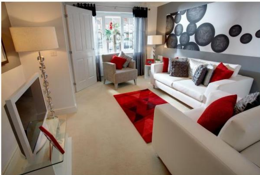
Inside Lovell's Arnfield show home at Lincoln Gardens Doncaster

Be the first of your friends to like this.