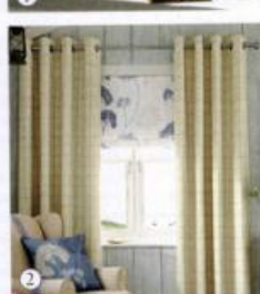
1 BLIND made from Elise fabric, £37 a metre, Voyage Decoration 2 Natural Woven Check Eyelet CURTAINS , from £55 for a lined pair, Next Home

FOR STORE DETAILS SEE 'WHERE TO BUY' PAGE