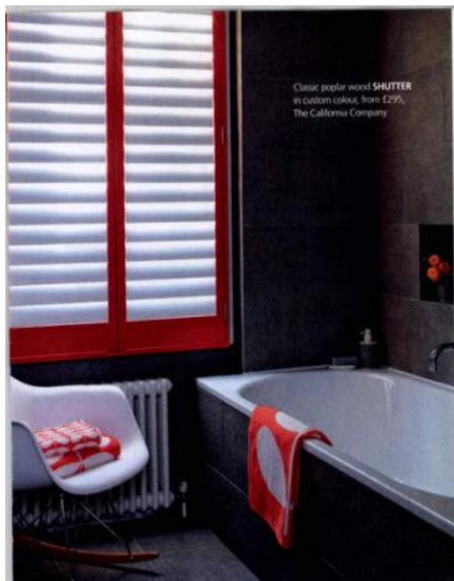
Classic poplar wood SHUTTER in custom colour, from £299, The California Company