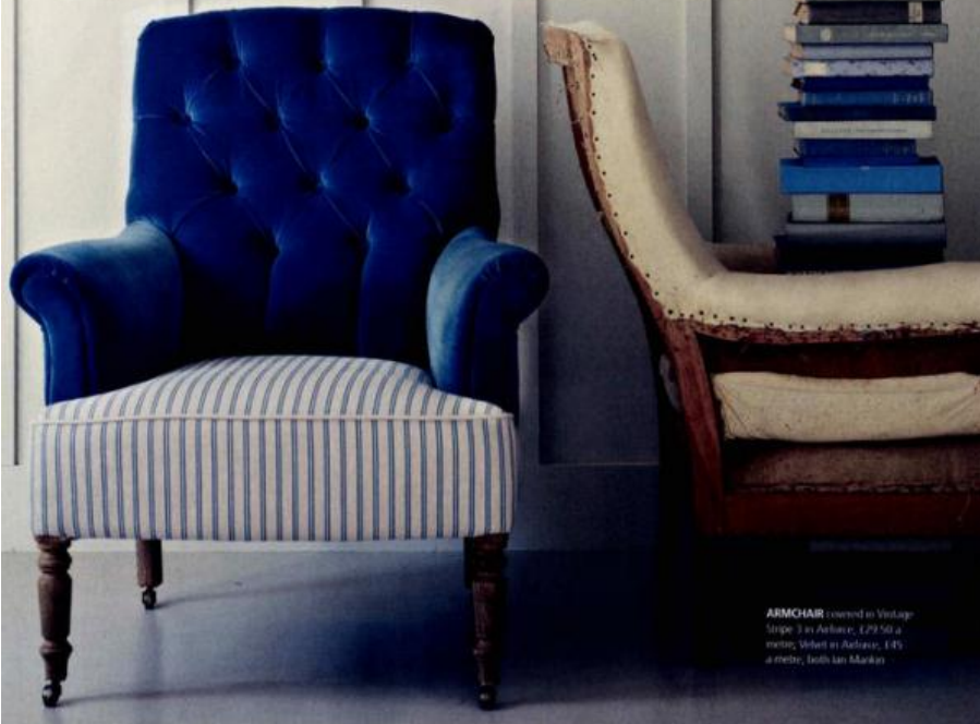
ARMCHAIR covered in Vintage Stripe 1 in Airforce, £2950 a meter, Velvet in Airforce, £45 a meter, South Sea Marjorie

If your chair's frame is in good condition but the cover is worn, consider giving it a new one. For a professional result it's worth employing an upholsterer. Contact the Association of Master Upholsterers & Soft Furnishers, 01494 452965; upholsterers.co.uk , to find one in your area. For a modern look, go for shades of indigo, airforce blue or navy, and one of this season's neutrals, such as pale taupe or sunny ochre. Accessorise with scatter cushions in coordinating patterns and shades.