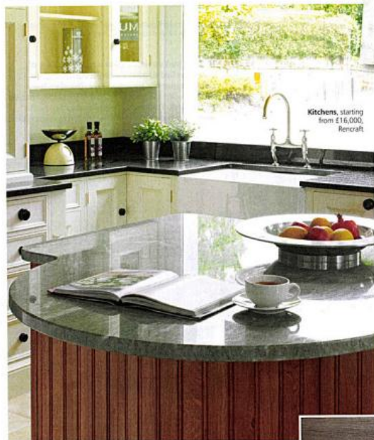
Kitchens, starting from £16,000, Rencraft

▼ Ask your kitchen designer's advice when considering work surfaces – this round island unit topped with a stunning granite surface would make a lovely addition if you have the space